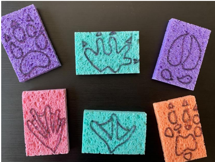
Figure G - footprints drawn on the sponges