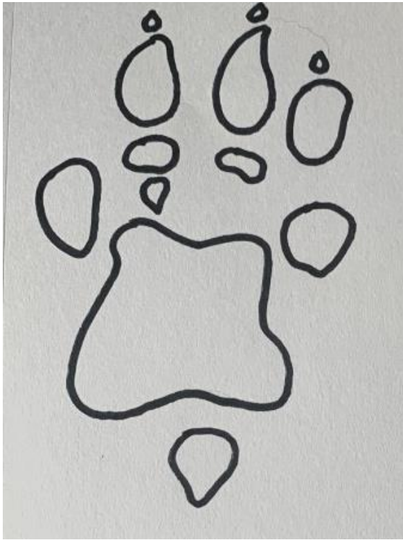
Figure A - North American River Otter