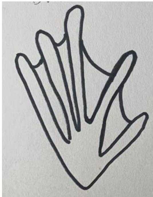
Figure C - Bullfrog