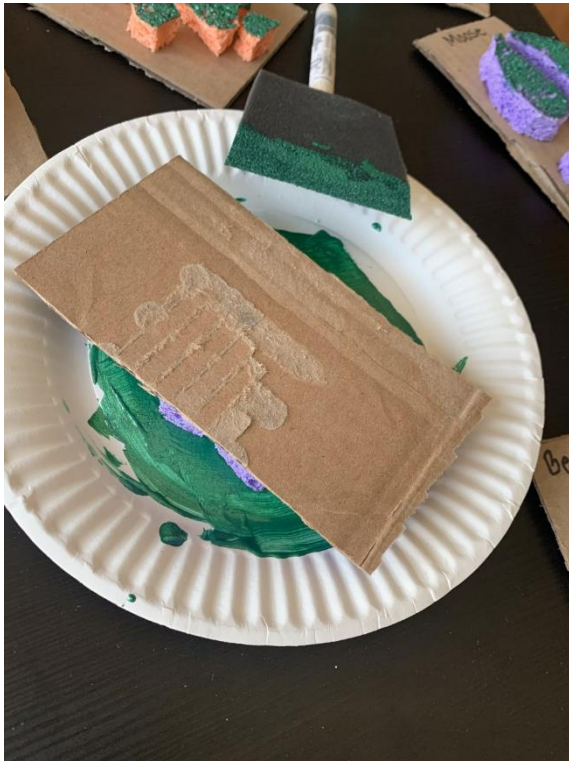
Figure I - dipping sponge on cardboard into paint