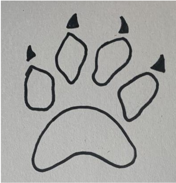
Figure E - Red Fox