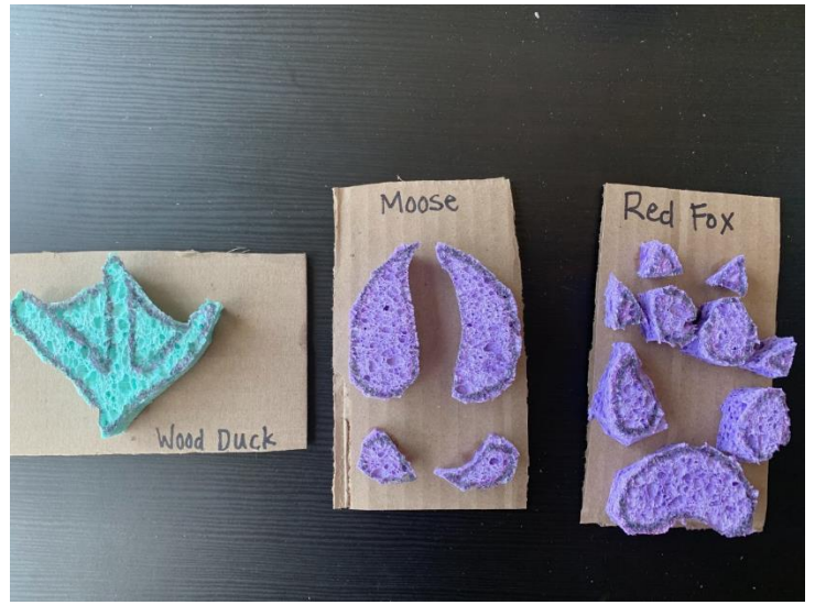
Figure H - cut out footprints glued on cardboard