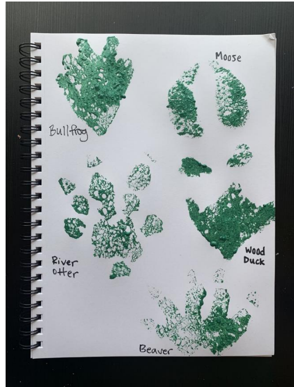
Figure J - animal footprints on paper