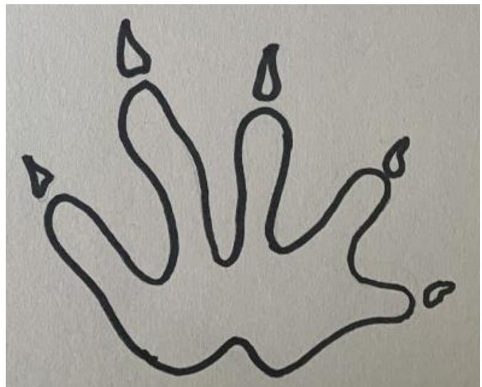
Figure D - Beaver